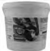
Premium Brand Lamb Colostrum