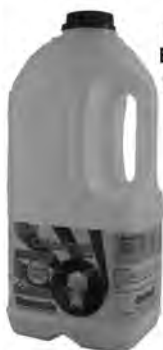
Premium Brand Calf Colostrum